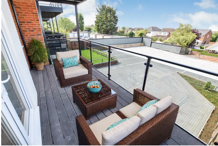
Large balcony with composite decking and tinted glass balustrade