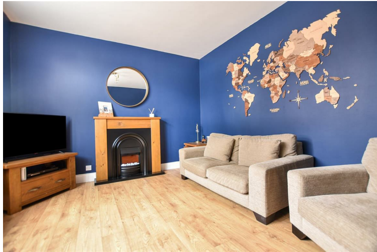
Lounge/2nd Reception Room 12'11 x 11'4 (3.94m x 3.45m)

Upvc double glazed window to front with blinds, radiator, laminate wood flooring, feature electric fire place.