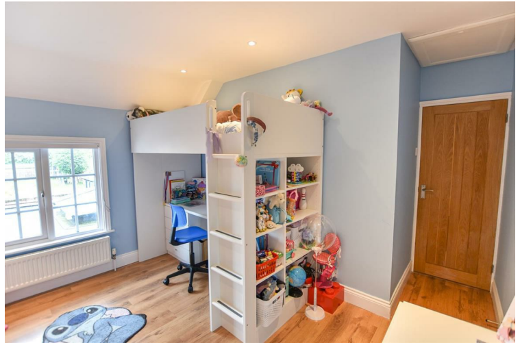
Bedroom 2 11'5 x 9'7 (3.48m x 2.92m)

Upvc double glazed window to rear, laminate wood flooring, radiator, air conditioning.