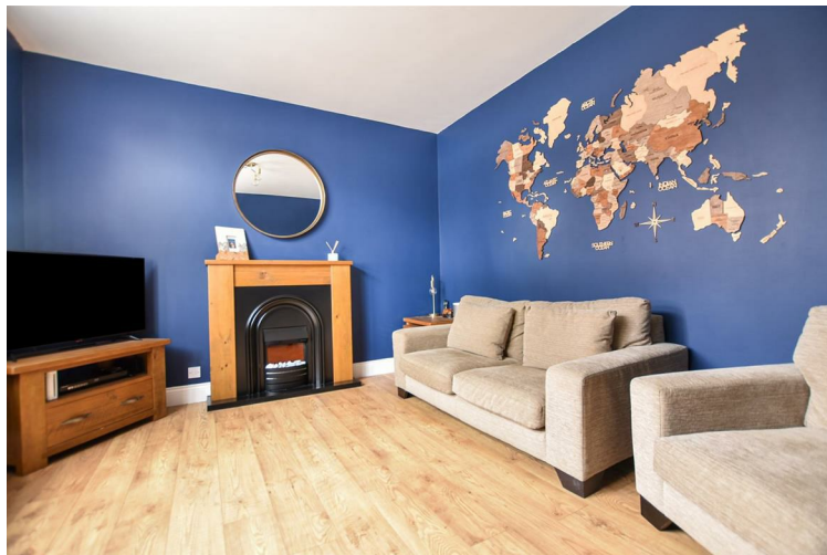
Lounge/2nd Reception Room 12'11 x 11'4 (3.94m x 3.45m)

Upvc double glazed window to front with blinds, radiator, laminate wood flooring, feature electric fire place.