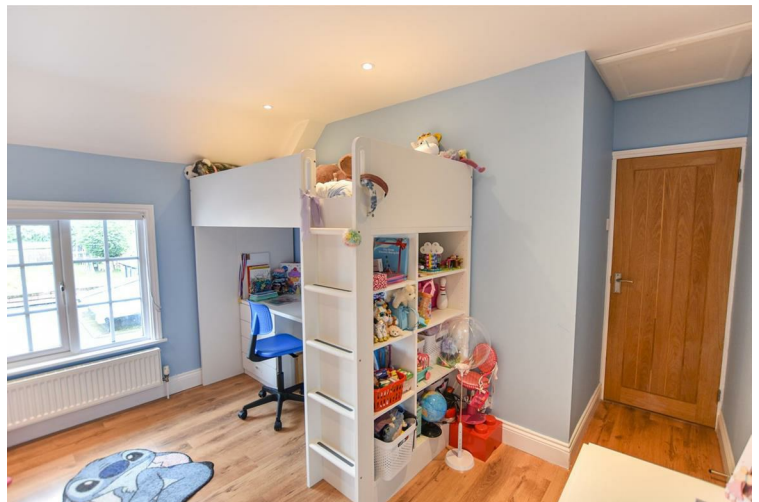
Bedroom 2 11'5 x 9'7 (3.48m x 2.92m)

Upvc double glazed window to rear, laminate wood flooring, radiator, air conditioning.