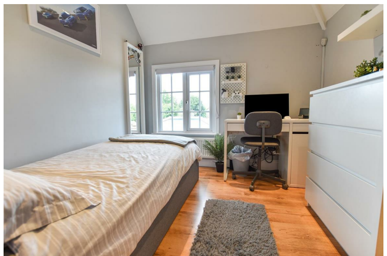
Bedroom 3 8'7 x 8'5 (2.62m x 2.57m)

Upvc double glazed window to rear, radiator, laminate wood flooring, air conditioning.