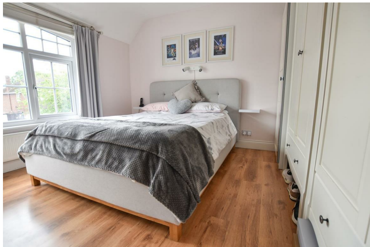
Bedroom 1 13' x 11'5 (3.96m x 3.48m)

Laminate wood flooring, smooth plastered ceiling Upvc double glazed window to front, radiator, air conditioning.