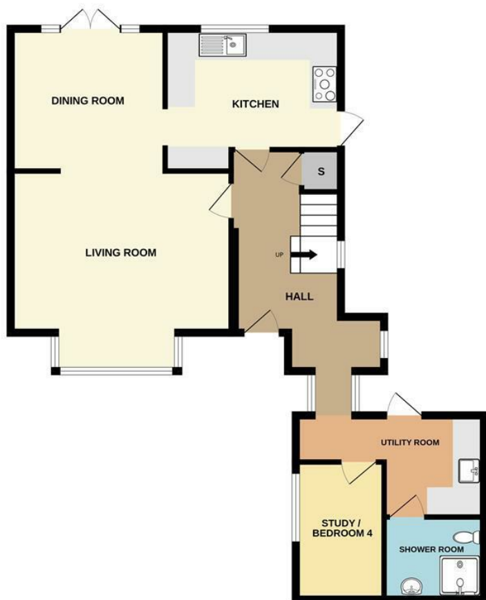
Ground Floor 771 sq.ft. (71.6 sq.m.) approx.