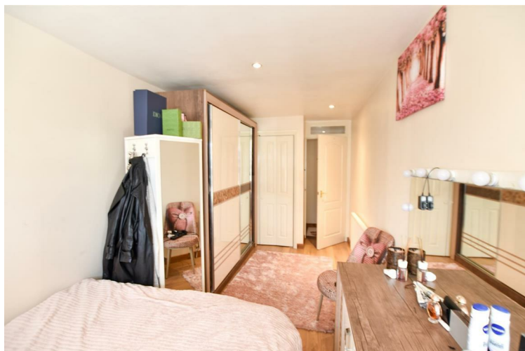
Bedroom 2 17'11 x 7'06 (5.46m x 2.29m)

Upvc double glazed window to front, wood flooring, smooth plastered ceiling with spot lighting, storage cupboard, radiator.