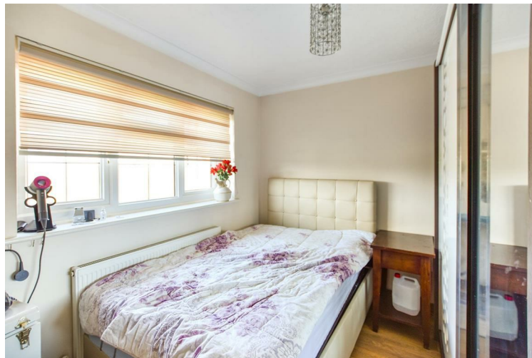
Bedroom 4 10'06 x 10'02 (3.20m x 3.10m)

Upvc double glazed window to rear, radiator, wood flooring, textured and covered ceiling.