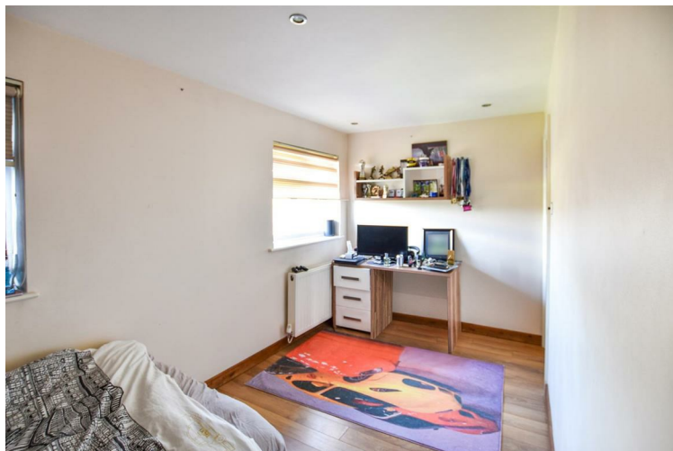
Bedroom 3 15'07 x 10'01 reducing to 7'01 (4.75m x 3.07m reducing to 2.16m)

Two Upvc double glazed windows to rear, radiator, wood flooring, smooth plastered ceiling with spot lighting.