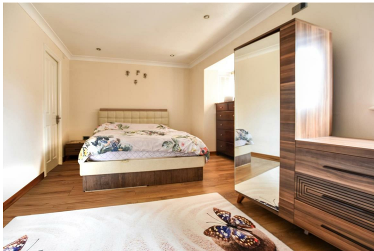
Bedroom 1 15'09 x 12'05 (4.80m x 3.78m)

Upvc double glazed bay window to front, wood flooring, radiator, further Upvc double glazed window to front, fitted wardrobes, smooth plastered and covered ceiling with spot lighting, built in wardrobe/cupboard, door leading to family bathroom with potential to convert part to an en-suite.