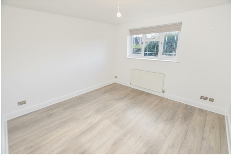
Bedroom 2 11'9" x 11'7" (3.58m x 3.53m)

Upvc double glazed window to front rear, smooth plastered ceiling, laminate flooring, radiator, tv and power points.