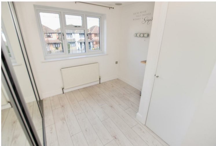
Bedroom 4 11'9" max x 8'3" (3.58m max x 2.51m)

Upvc double glazed window to front aspect, smooth plastered ceiling, laminate flooring, radiator, power points and storage cupboard.