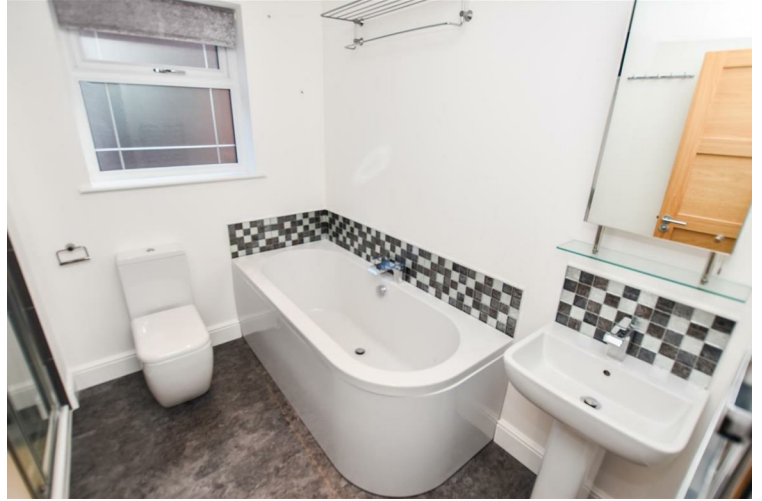
Family Bathroom 8'2" x 5'8" (2.49m x 1.73m)

Upvc obscure double glazed window to side aspect, smooth plastered ceiling, vinyl flooring, spotlights, large tiled shower cubicle with shower tower panel, panelled bath with chrome mixer tap and mosaic style splashback, pedestal wash hand basin with chrome mixer tap, close coupled W.C.