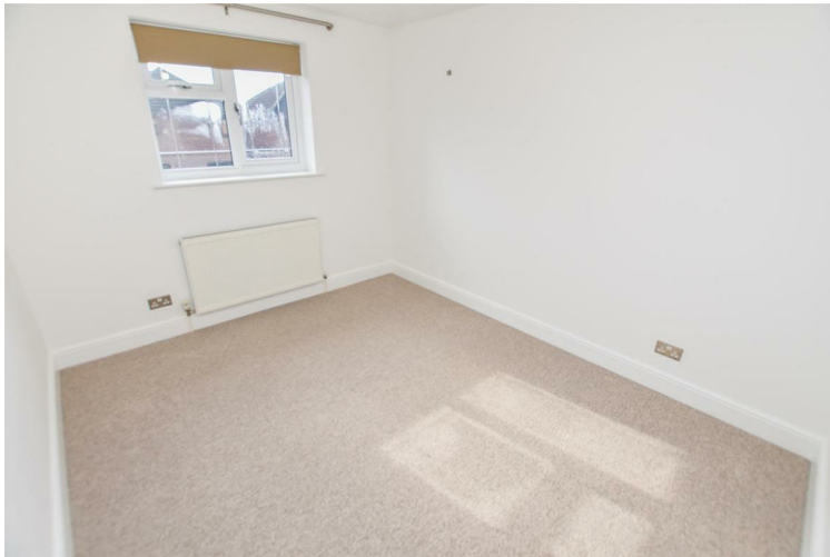
Bedroom 3 11'6" x 9'5" (3.51m x 2.87m)

Upvc double glazed window to rear aspect, smooth plastered ceiling, carpet, radiator, tv and power points.