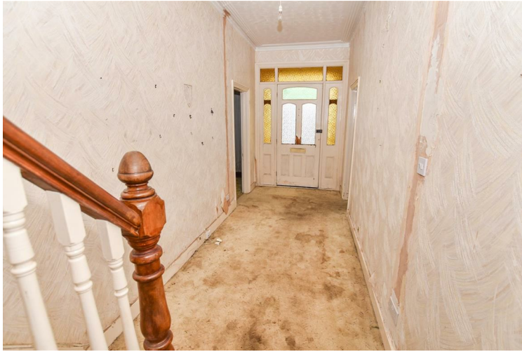
Entrance Hall 6'0 x 24'3 (1.83m x 7.39m)