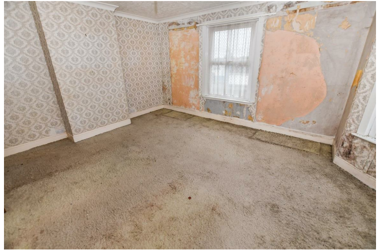
Bedroom Three 14'0 x 11'0 (4.27m x 3.35m)