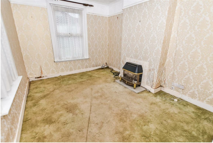
Reception Room Three 14'0 x 11'0 (4.27m x 3.35m)