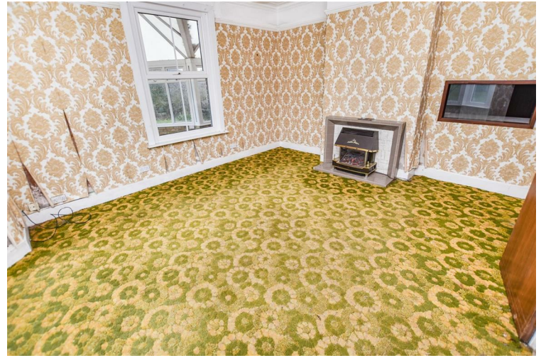
Reception Room Two 17'5 x 14'5 (5.31m x 4.39m)