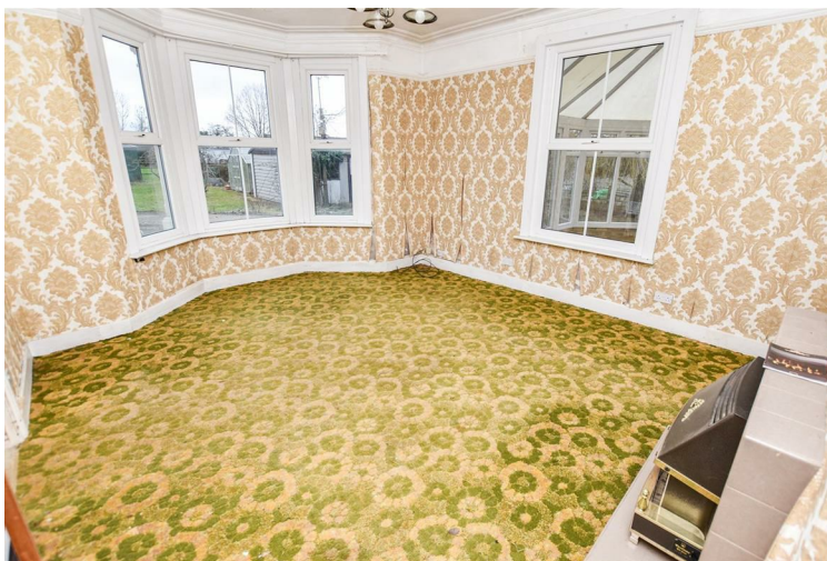
Reception Room One 17'10 x 14'0 (5.44m x 4.27m)