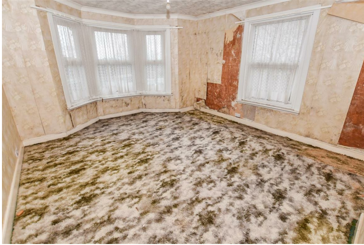
Bedroom One 17'6 x 14'0 (5.33m x 4.27m)