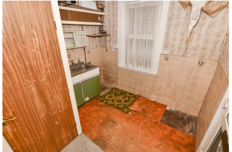
Utility/Wc 9'0 x 8'6 (2.74m x 2.59m)