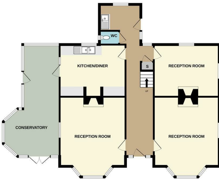
1st Floor 984 sq.ft. (91.4 sq.m.) approx.