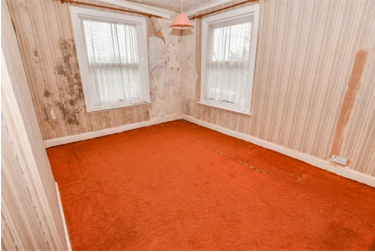
Bedroom Four 14'0 x 11'0 (4.27m x 3.35m)