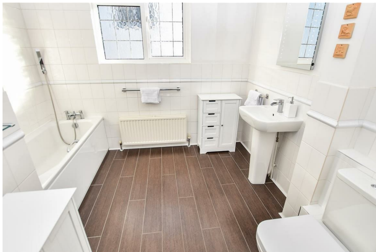
Luxury Modern Bathroom 9'1 x 9 (2.77m x 2.74m)

Window to flank, modern white suite comprising of panelled bath with handgrips and mixer tap shower attachment, pedestal wash hand basin with mixer tap, half tiled walls and fully tiled to bath area, radiator, tiled flooring.