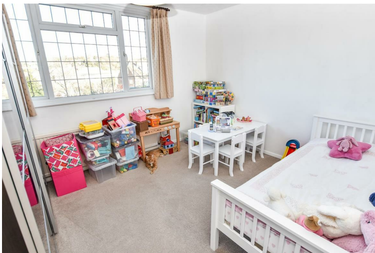
Bedroom Three 12'1 x 10'5 (3.68m x 3.18m)

Window to rear, eaves cupboard, radiator, skimmed ceiling.