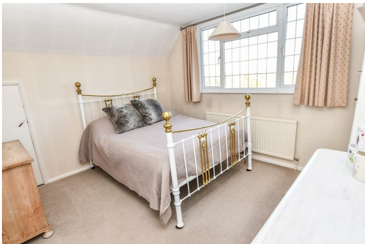
Bedroom Two 12'4 x 11'6 (3.76m x 3.51m)

Window to rear, eaves cupboard, radiator, skimmed ceiling.