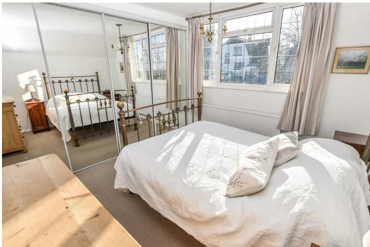
Bedroom One 11'7 x 10'2 (3.53m x 3.10m)

Window to front, radiator, range of sliding mirror fronted wardrobes to one wall, skimmed ceiling.