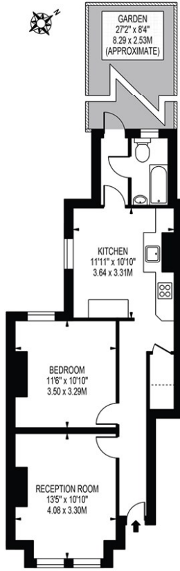
GROUND FLOOR FOR ILLUSTRATION PURPOSES ONLY

APPROXIMATE GROSS INTERNAL FLOOR AREA: 553 SQ.FT - 51.42 SQ.M