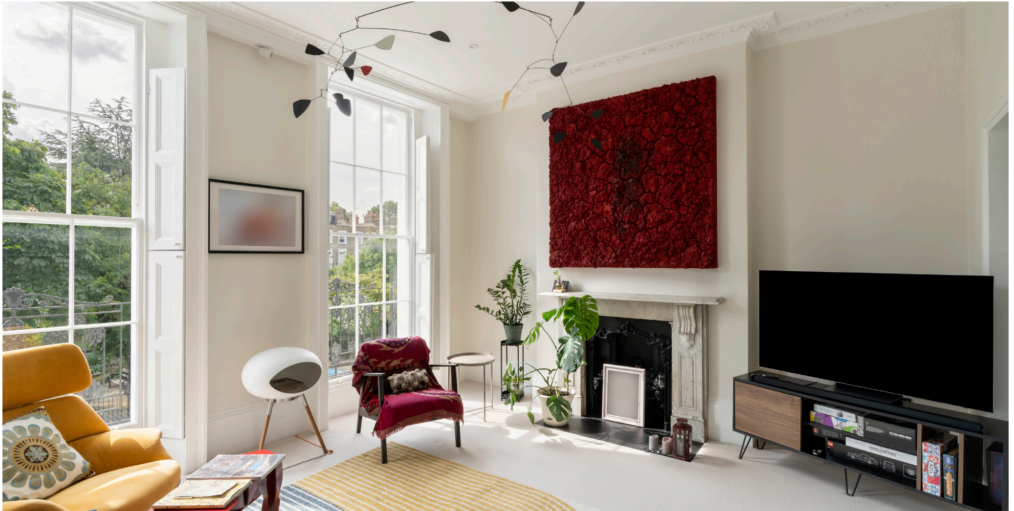
GIBSON SQUARE, Islington N1