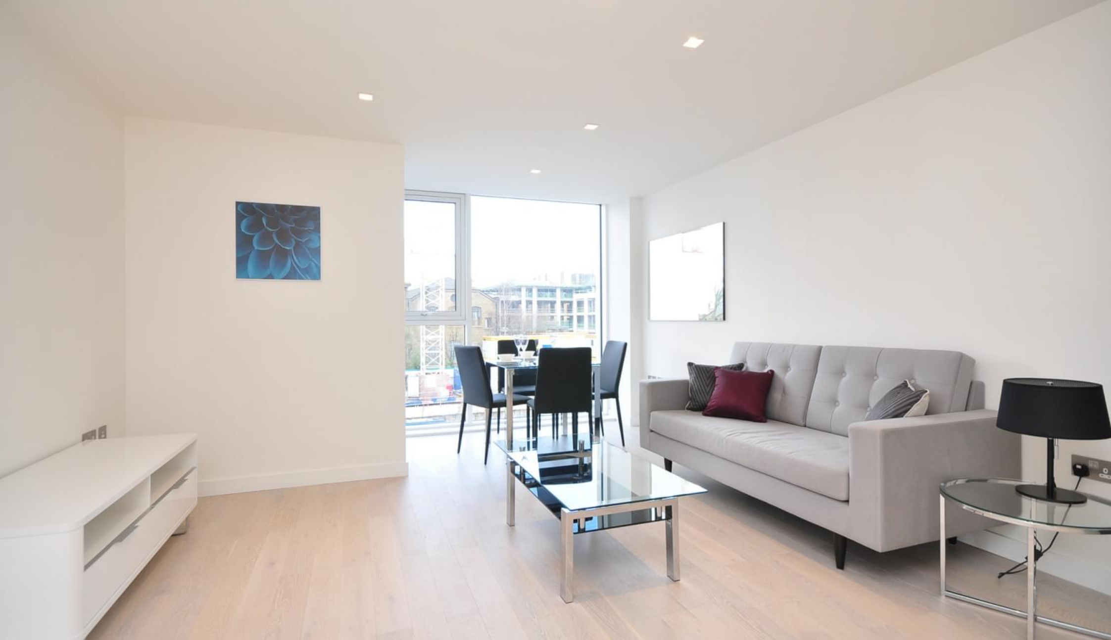
Spelow Apartments, Islington NI