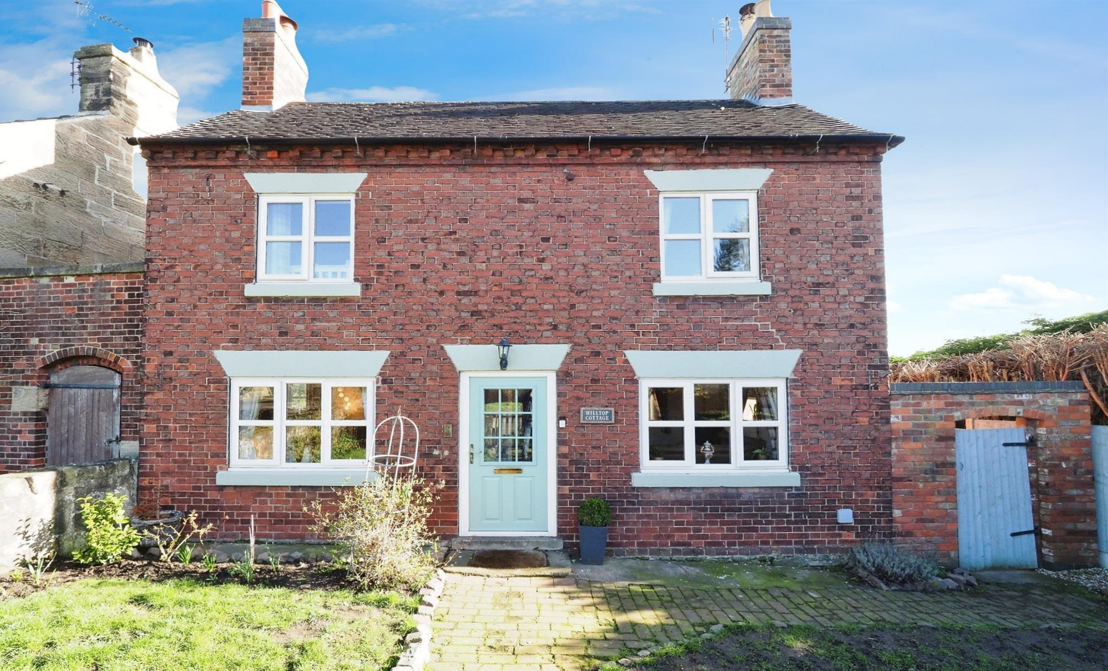
Hilltop Cottage Derby Road Stanton-by-Bridge DERBY