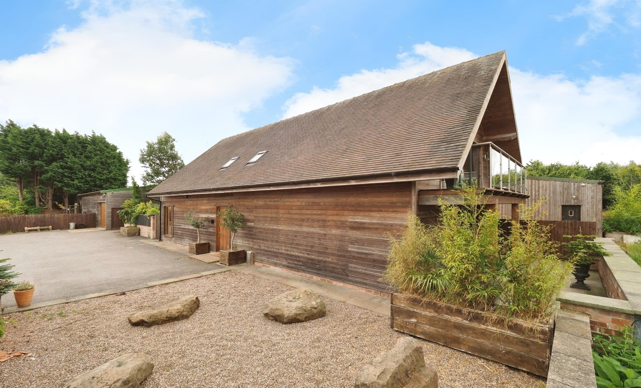
Olive Lodge Cockshut Lane Melbourne DERBY