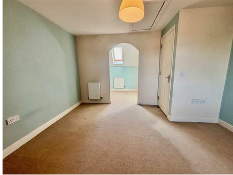
Dressing Room 7'7 x 6'7 (2.31m x 2.01m)