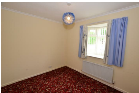
Bedroom Two 10'6" x 8'10" (3.21 x 2.70)

Having radiator and UPVC double glazed oriel bay window to front aspect.