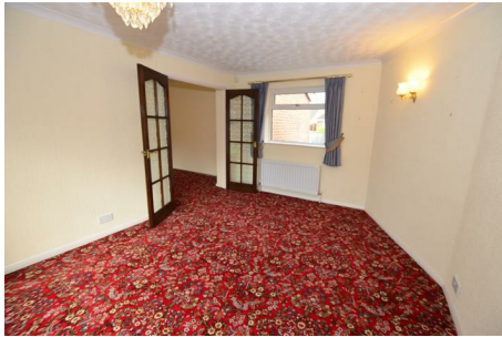
Bedroom One 13'6" x 10'1" (4.12 x 3.08)