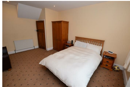
Bedroom Three 13'1" x 8'0" (4.01 x 2.44)

Having melamine panelled walls, low centre flush wc, laminated rolled edge working surface incorporating an inset stainless steel sink with extendable hot and cold mixer tap, space and plumbing for automatic washing machine, space for dryer, radiator, Worcester wall mounted combination gas boiler, wall mounted extractor fan, together with a Dimplex wall mounted electric heater and UPVC opaque double glazed window to side aspect.