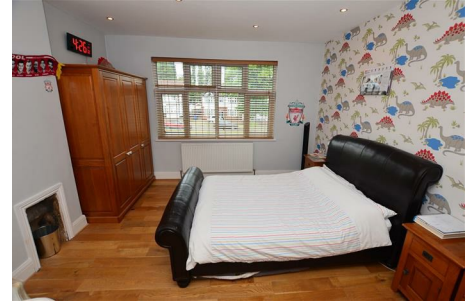
Bedroom Two 14'10" x 12'10" (4.53 x 3.93)

Having a feature solid wood floor, radiator, ceiling LED down lighters, recessed wardrobe and UPVC double glazed windows to both front and side aspects.