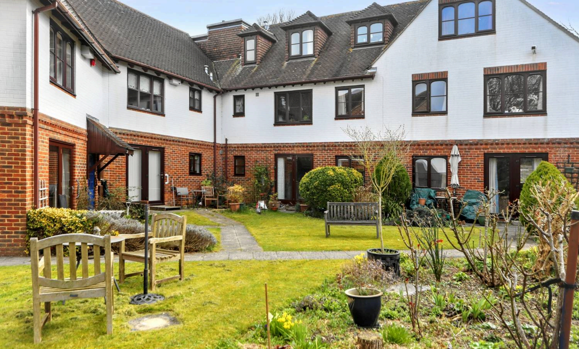
3 Southbrook Mews, Bishops Waltham - SO32 1RZ OIEO £130,000