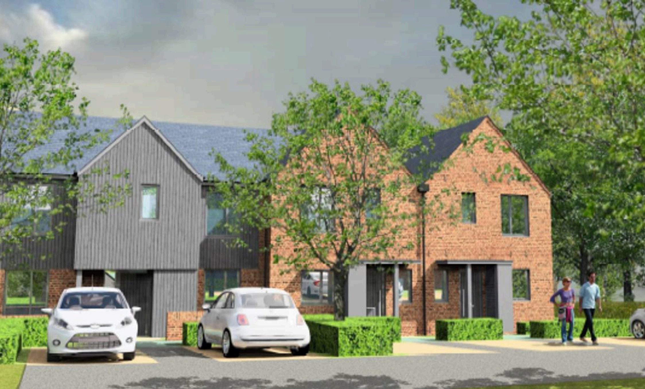
Plot 6 Meadoways, Curdridge Southampton SO32 2WB