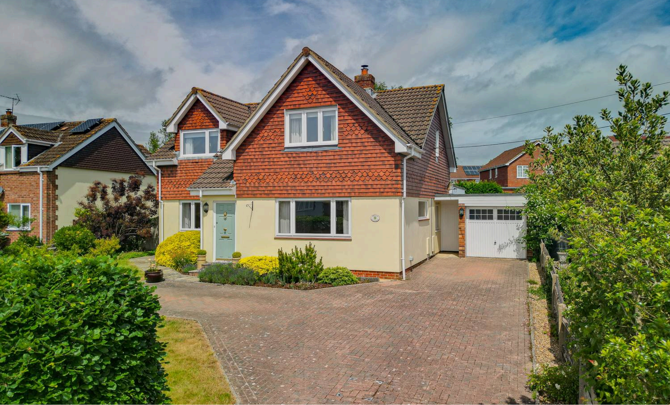
Beech Cottage Spring Lane, Swanmore - SO32 2PT £825,000