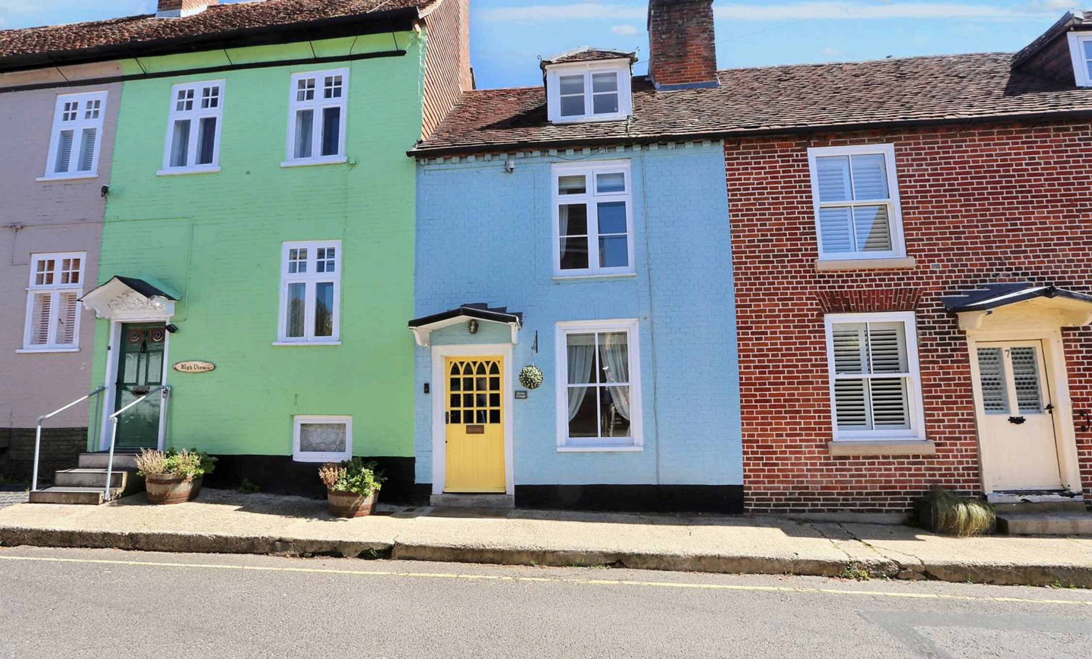
Spring Cottage, 8 Lower Basingwell Street, Bishops Waltham - SO32 1AJ £625,000