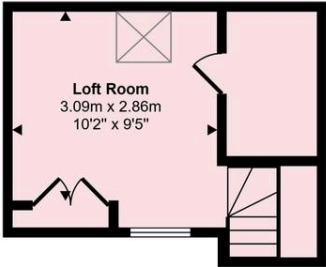
Second Floor Approx 16 sq m / 168 sq ft