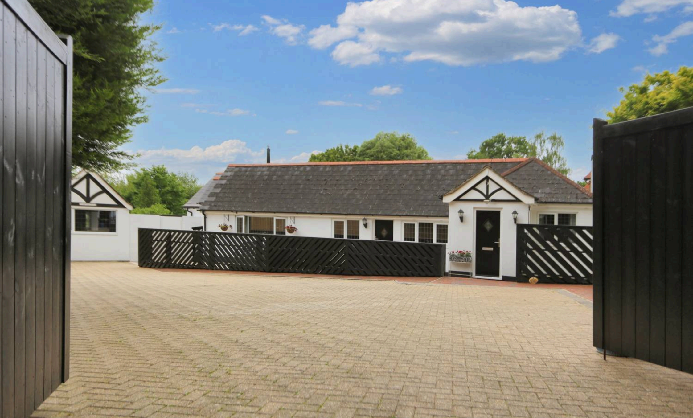
Primrose Cottage Turkey Island, Shedfield - SO32 2JE £675,000