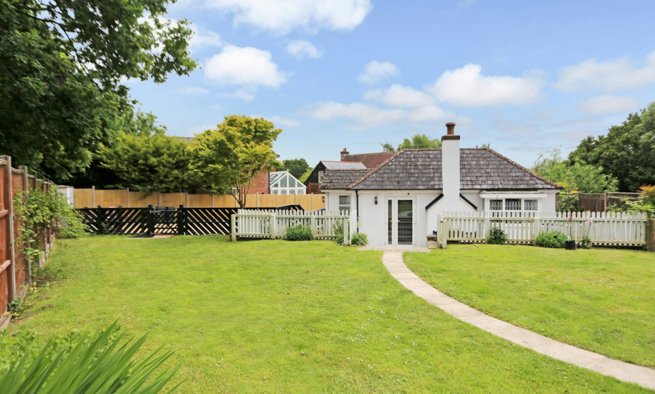
Primrose Cottage Turkey Island, Shedfield - SO32 2JE £775,000