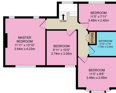
1ST FLOOR 611 sq ft (56.8 sqm) approx.