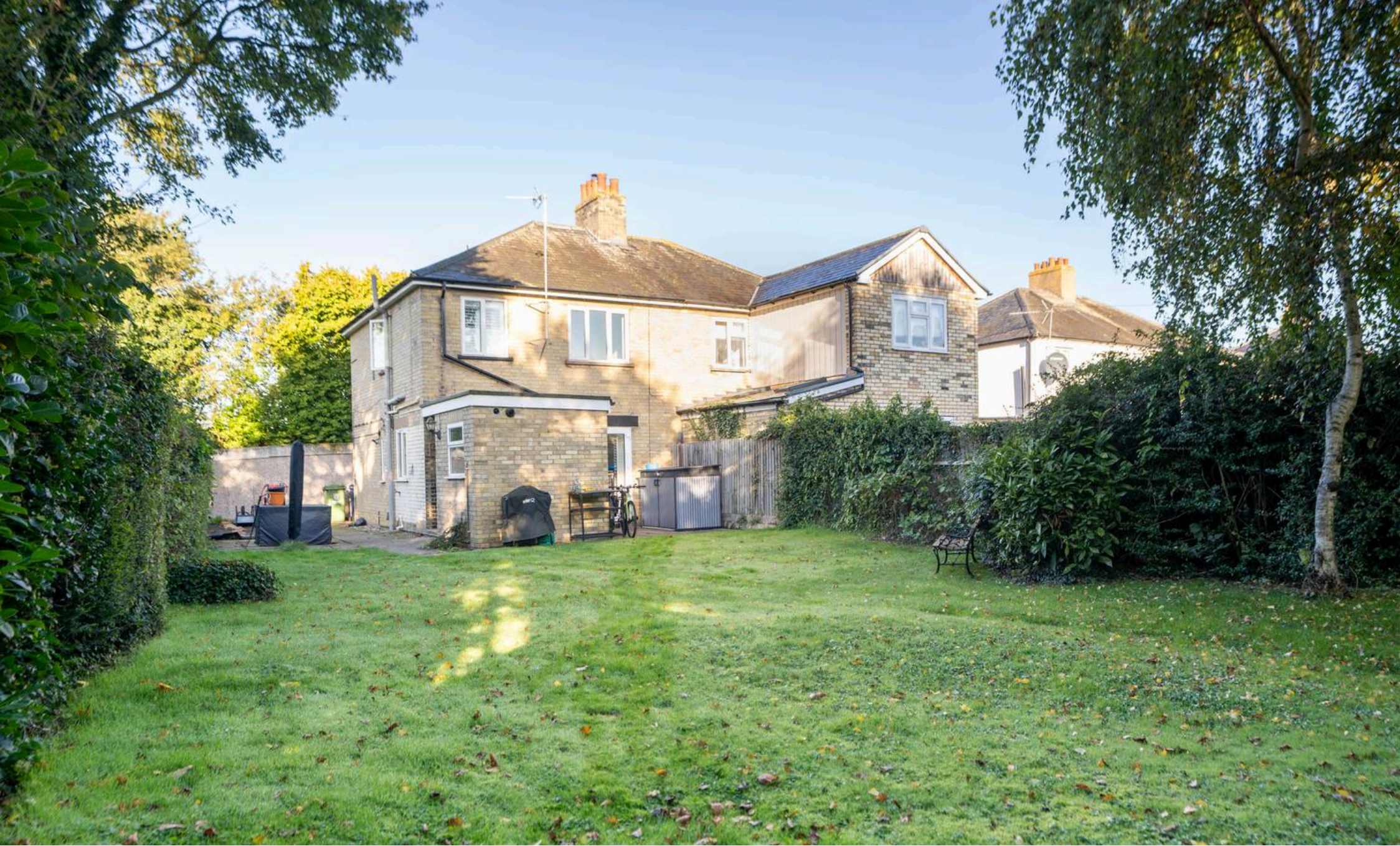
14 Westfield, Willingham Cambridge