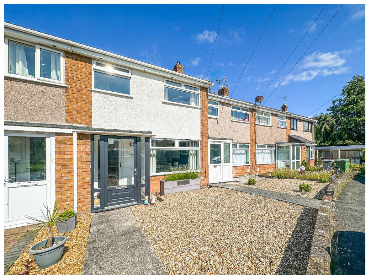
Anderson Close, Irby, Wirral CH61 3UU