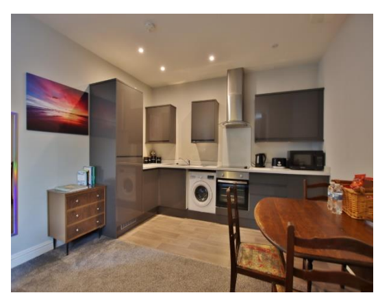
Offers Over £65,000 – No Onward Chain