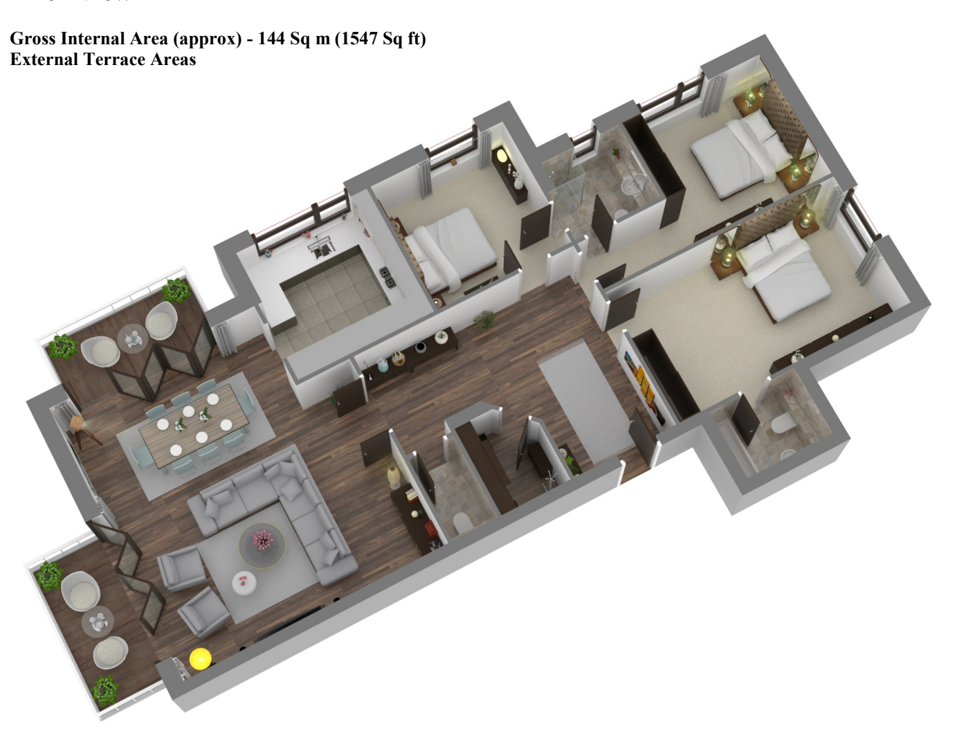
Please note:- A director of Frobishers Property Limited has a personal interest in this property