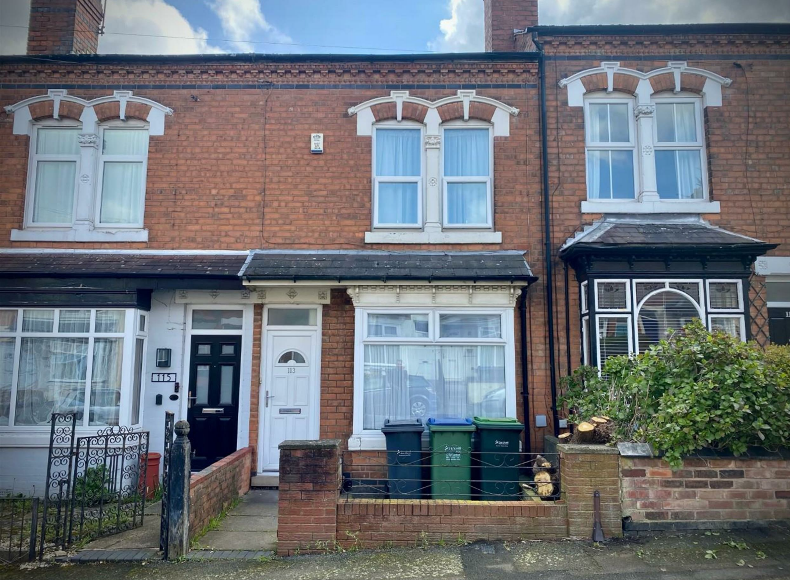
Katherine Road, Smethwick