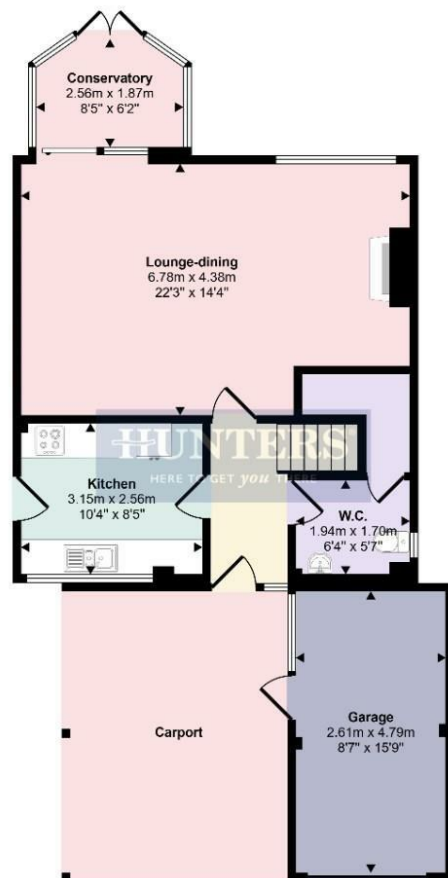
Ground Floor Approx 67 sq m / 721 sq ft

This floorplan is only for illustrative purposes and is not to scale. Measurements of rooms, doors, windows, and any items are approximate and no responsibility is taken for any error, omission or mis-statement. Icons of items such as bathroom suites are representations only and may not look like the real items. Made with Made Snappy 360.