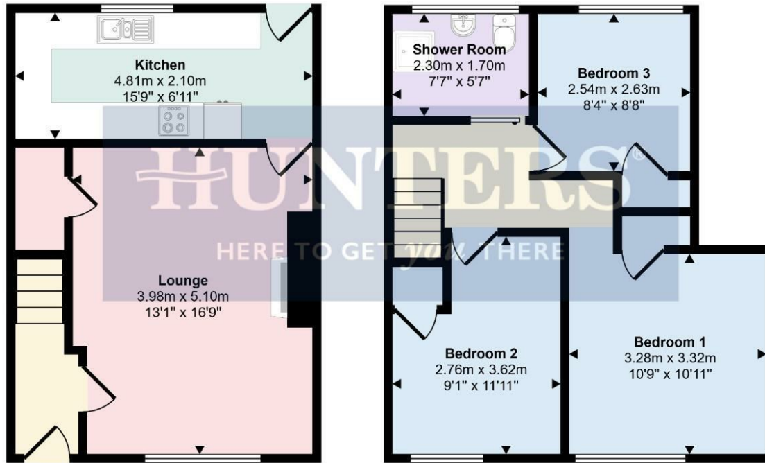
Ground Floor Approx 36 sq m / 386 sq ft

Approx Gross Internal Area 76 sq m / 822 sq ft