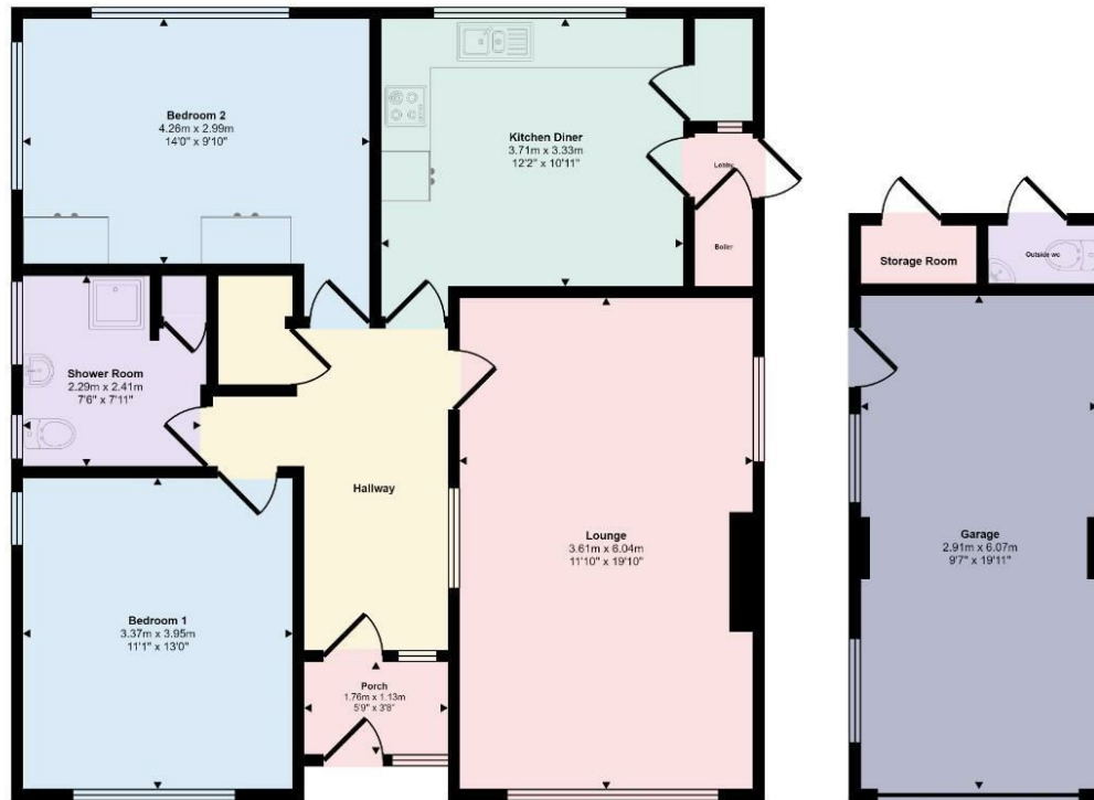
Ground Floor Approx 86 sq m / 921 sq ft

Approx Gross Internal Area 106 sq m / 1137 sq ft