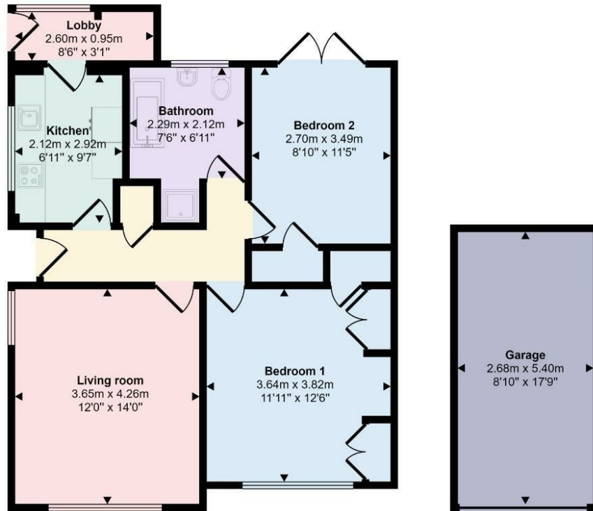
Floorplan Approx 64 sq m / 690 sq ft

Approx Gross Internal Area 79 sq m / 846 sq ft