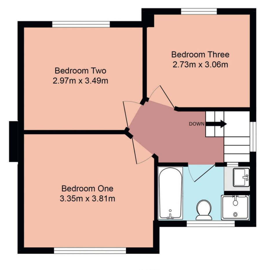
1st Floor 40.6 sq.m. approx.