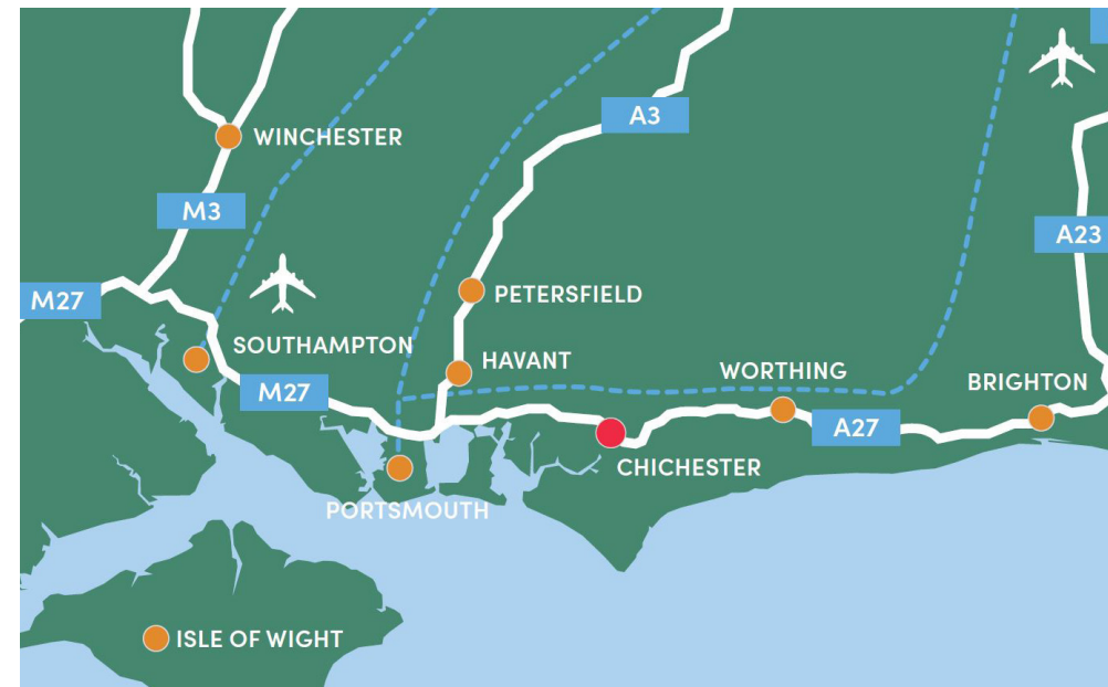
Maps and plans are for indicative purposes only

Once constructed, this new build retail unit will provide a total of 3,943 sq ft, and is available as a whole or individually. The unit can be built to suit, or rent from shell and core.