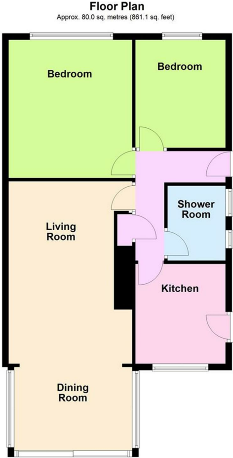
Total area: approx. 80.0 sq. metres (861.1 sq. feet)