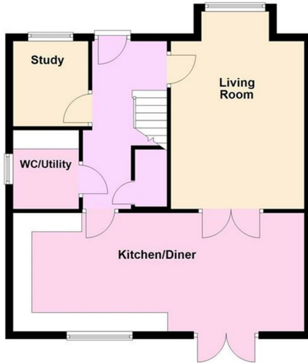
Ground Floor Approx. 79.1 sq. metres (851.5 sq. feet)