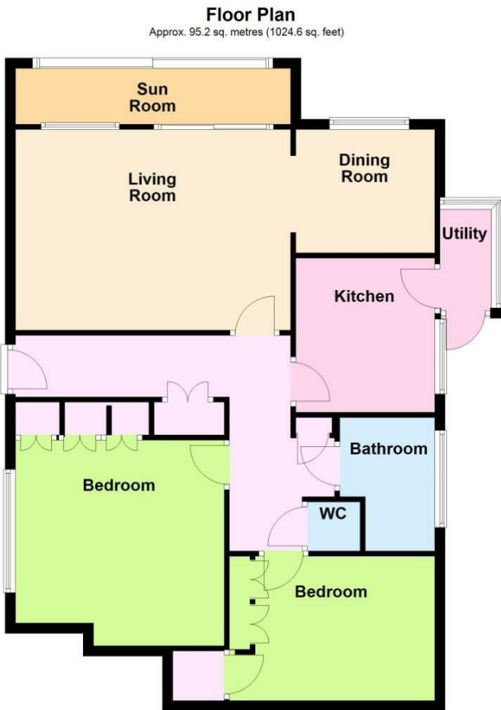
Total area: approx. 95.2 sq. metres (1024.6 sq. feet)