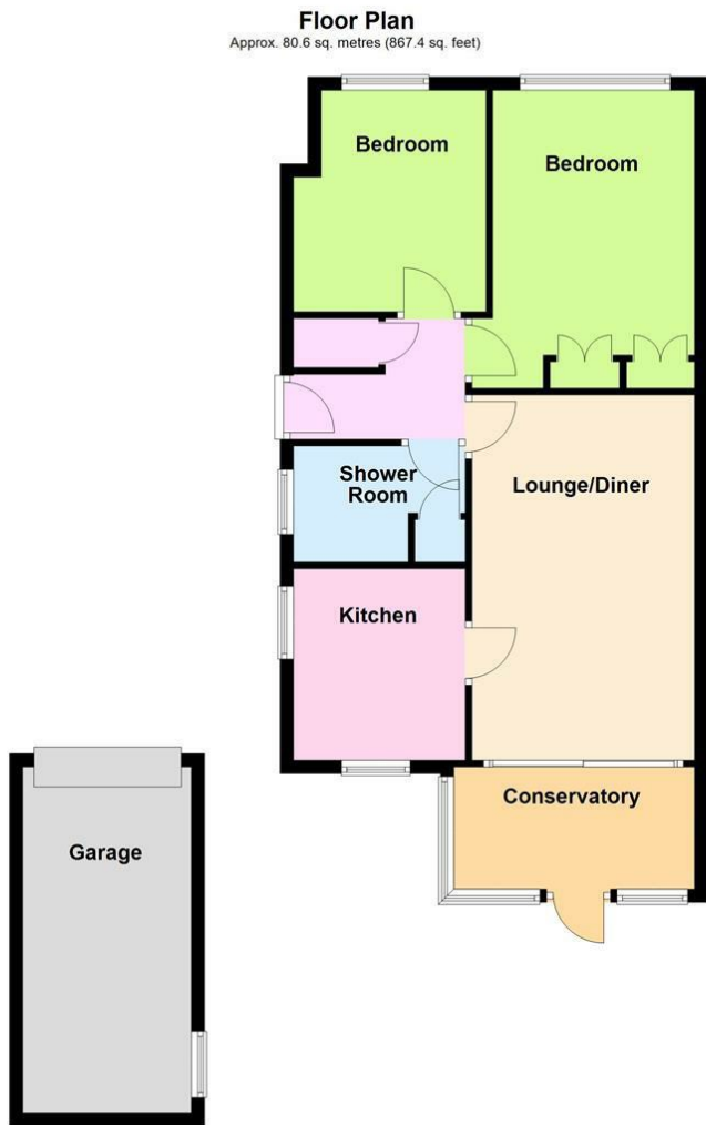
Total area: approx. 80.6 sq. metres (867.4 sq. feet)