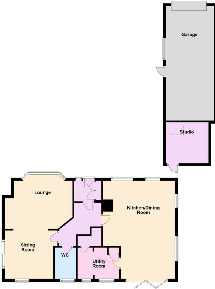
Ground Floor Approx. 113.8 sq. metres (1224.7 sq. feet)