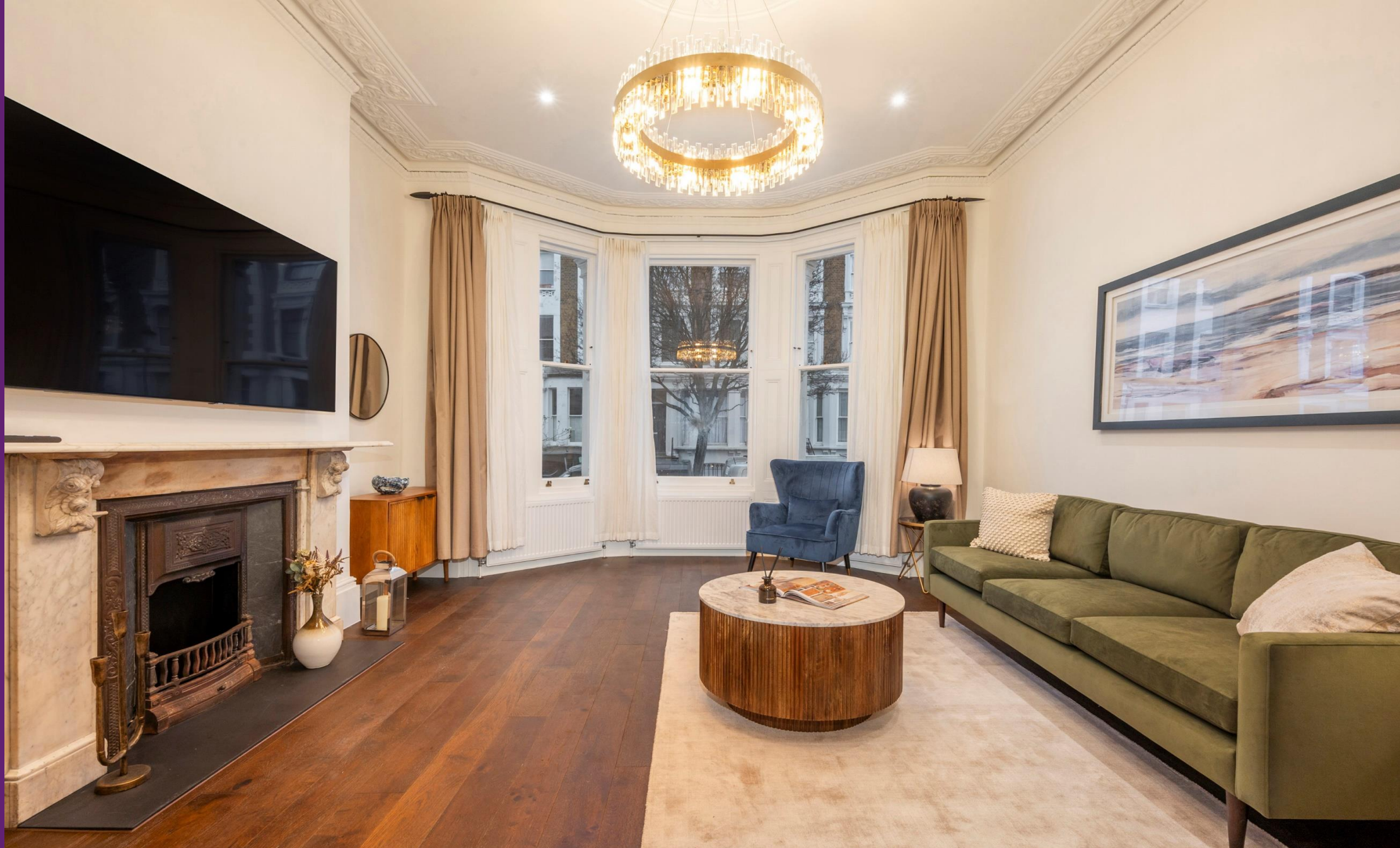
St. Lawrence Terrace London, W10