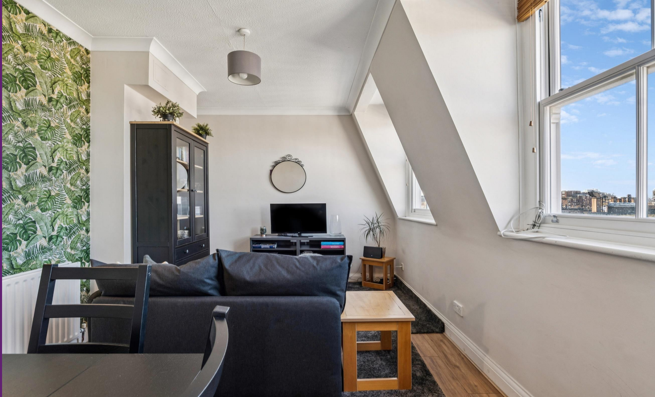
Radford House 1 Pembridge Gardens, W2