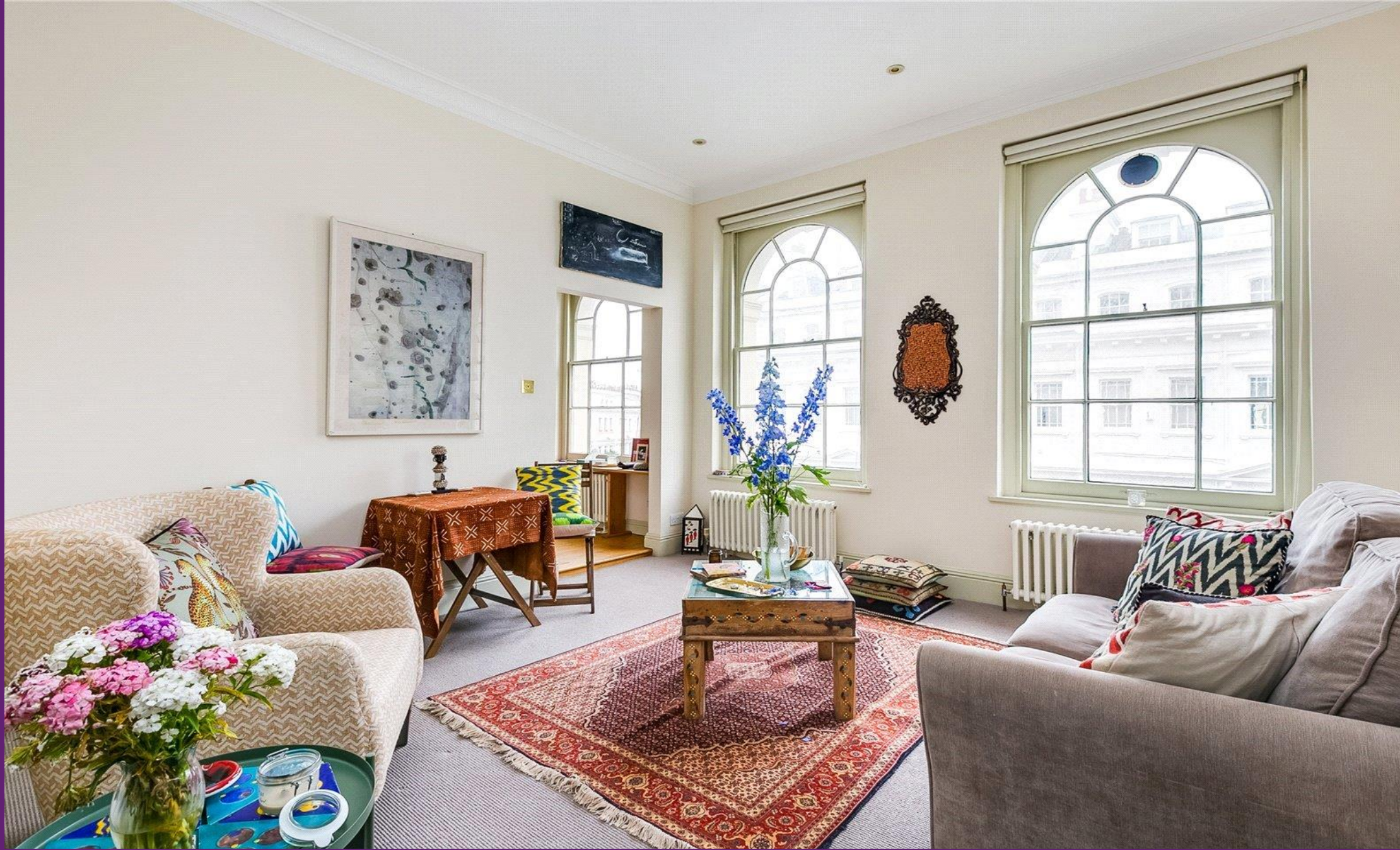
Stanley Gardens Notting Hill, W11