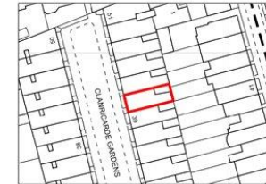
SITE LOCATION PLAN 1/1250