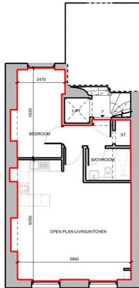
FLAT 7 - SECOND FLOOR GIA - 55.4 sqm / 597 sqft