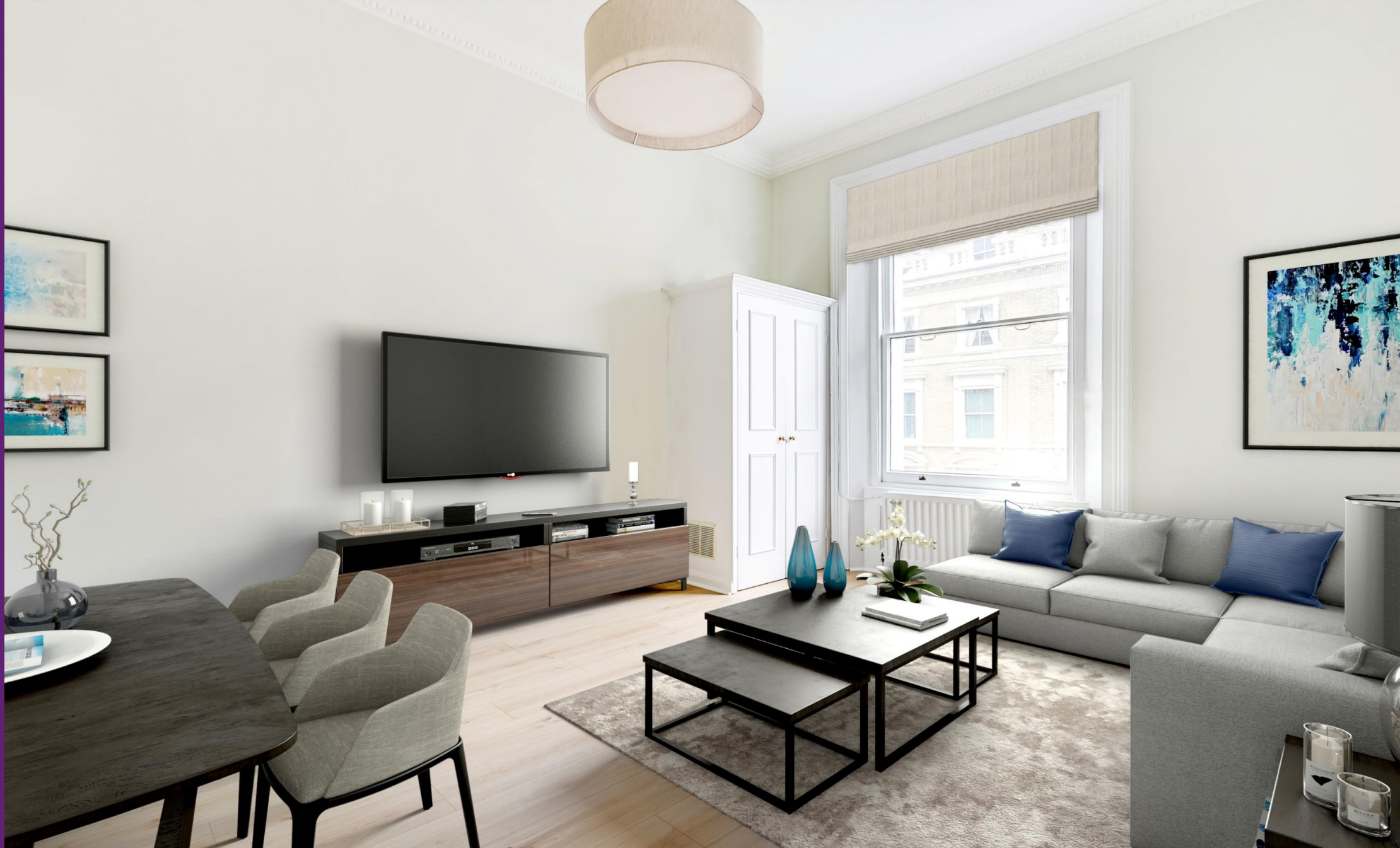
Clanricarde Gardens Notting Hill, W2