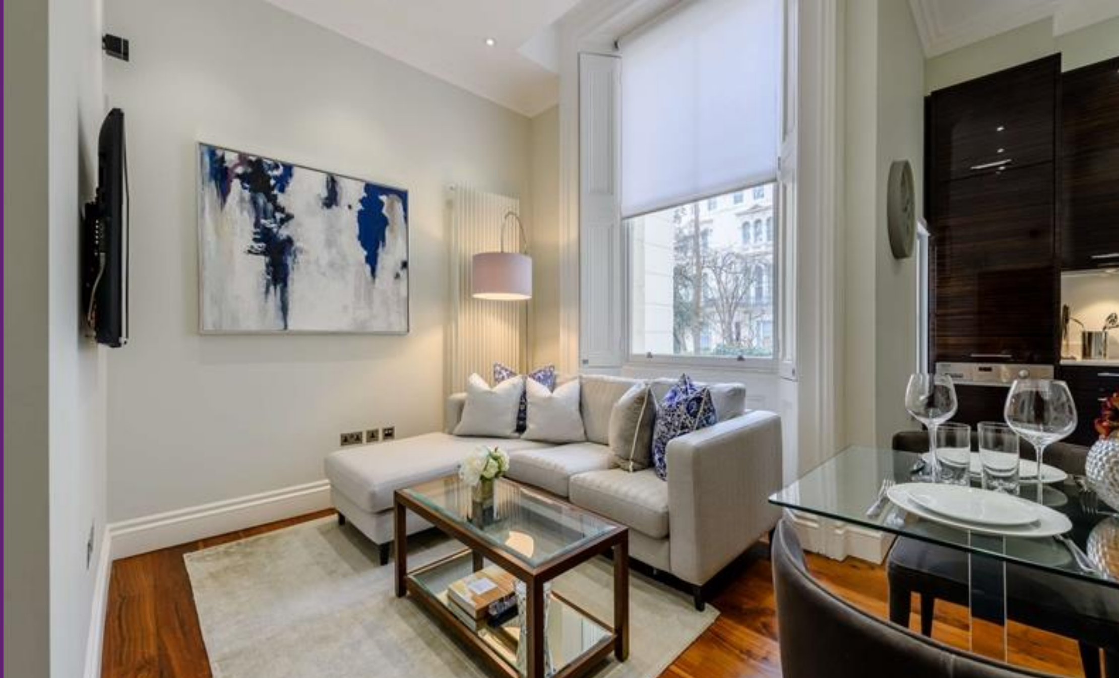
Garden House Kensington Garden Square, W2