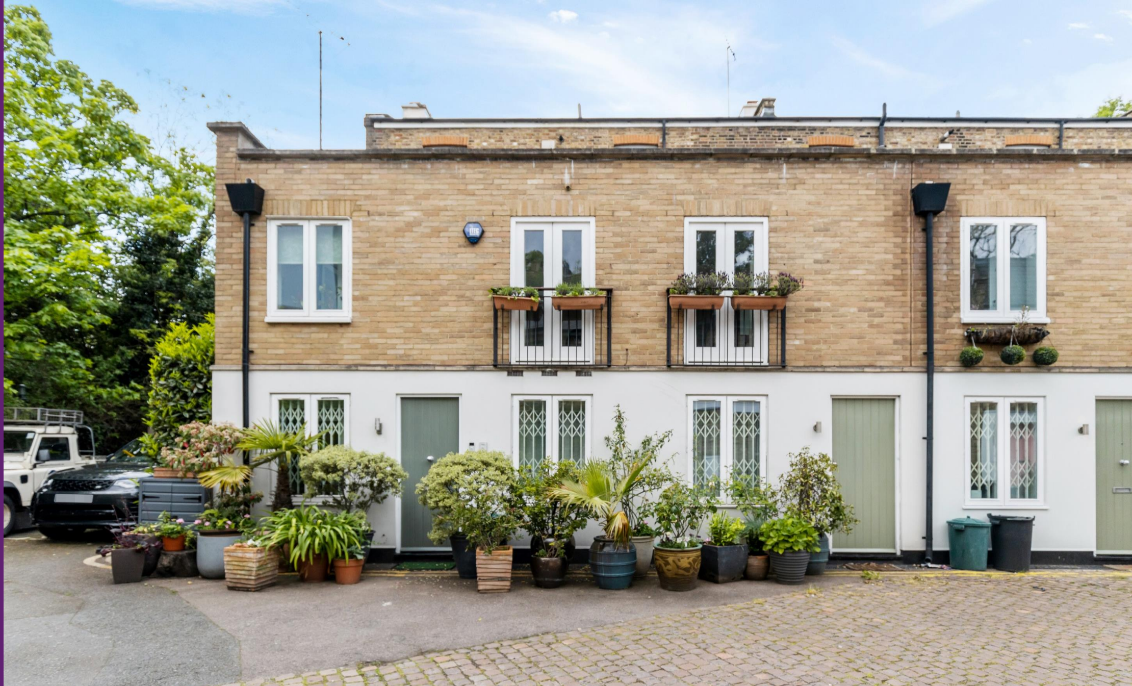
Royal Crescent Mews Shepherd's Bush , W11