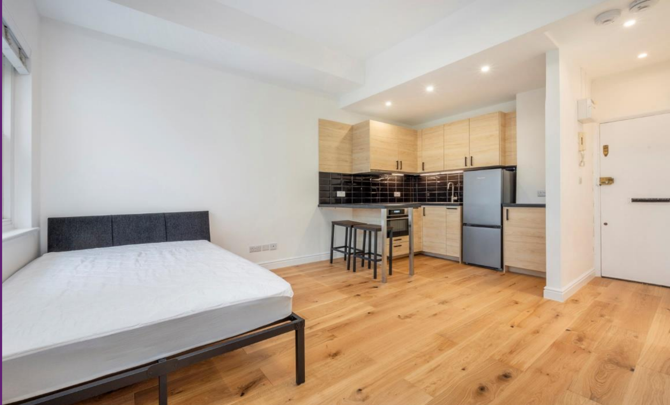
Radford House Notting Hill, W2