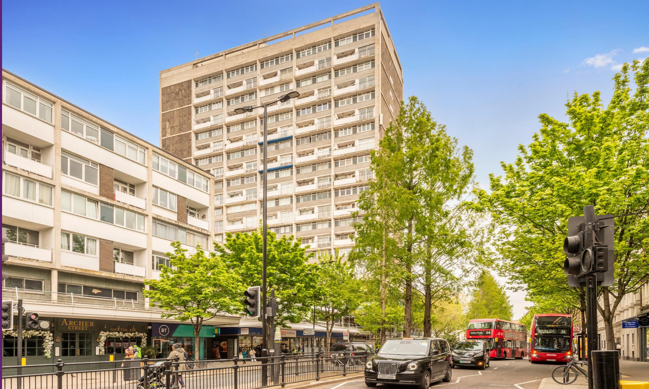
Campden Hill Towers Notting Hill Gate, W11