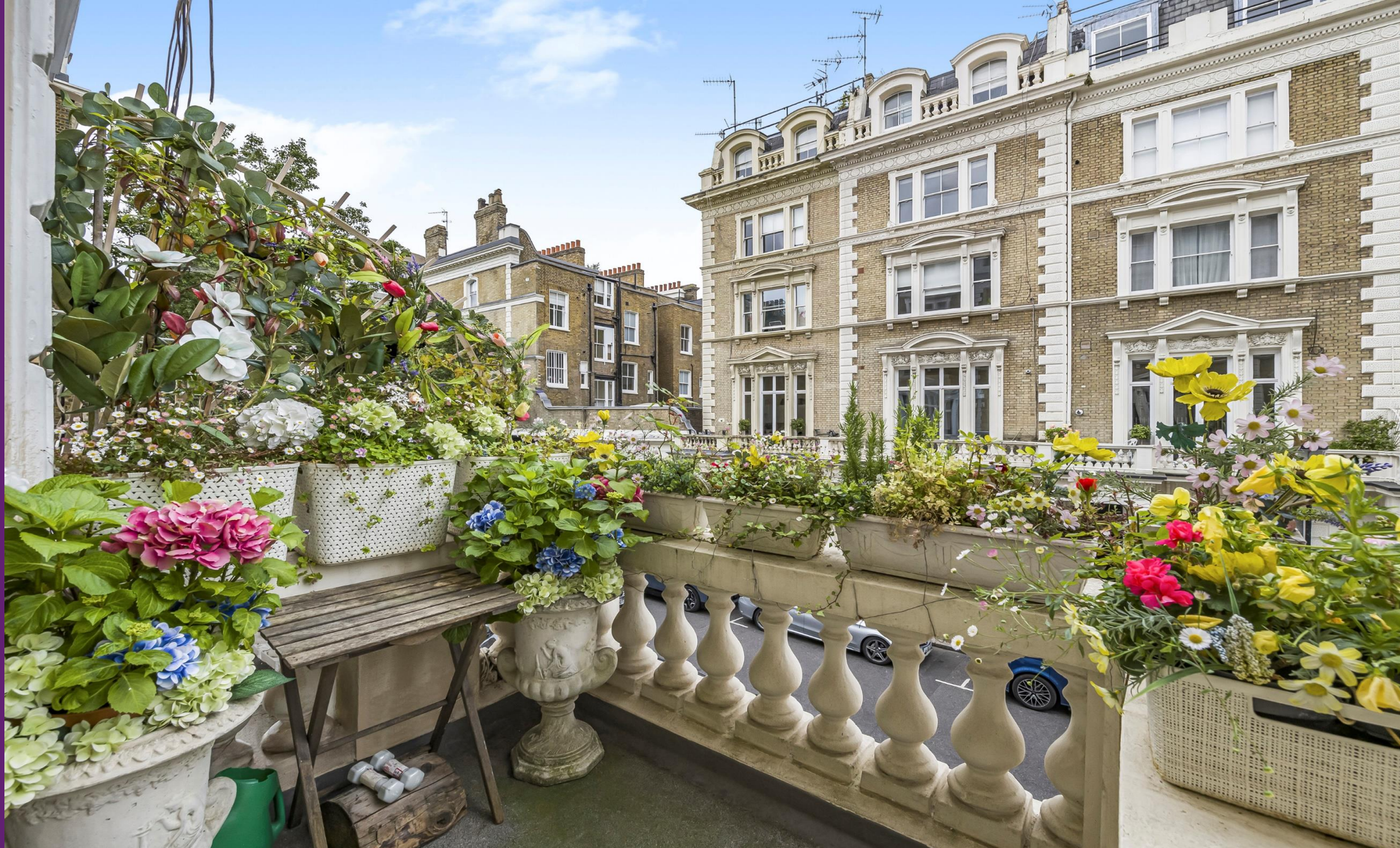
Clanricarde Gardens Notting Hill, W2