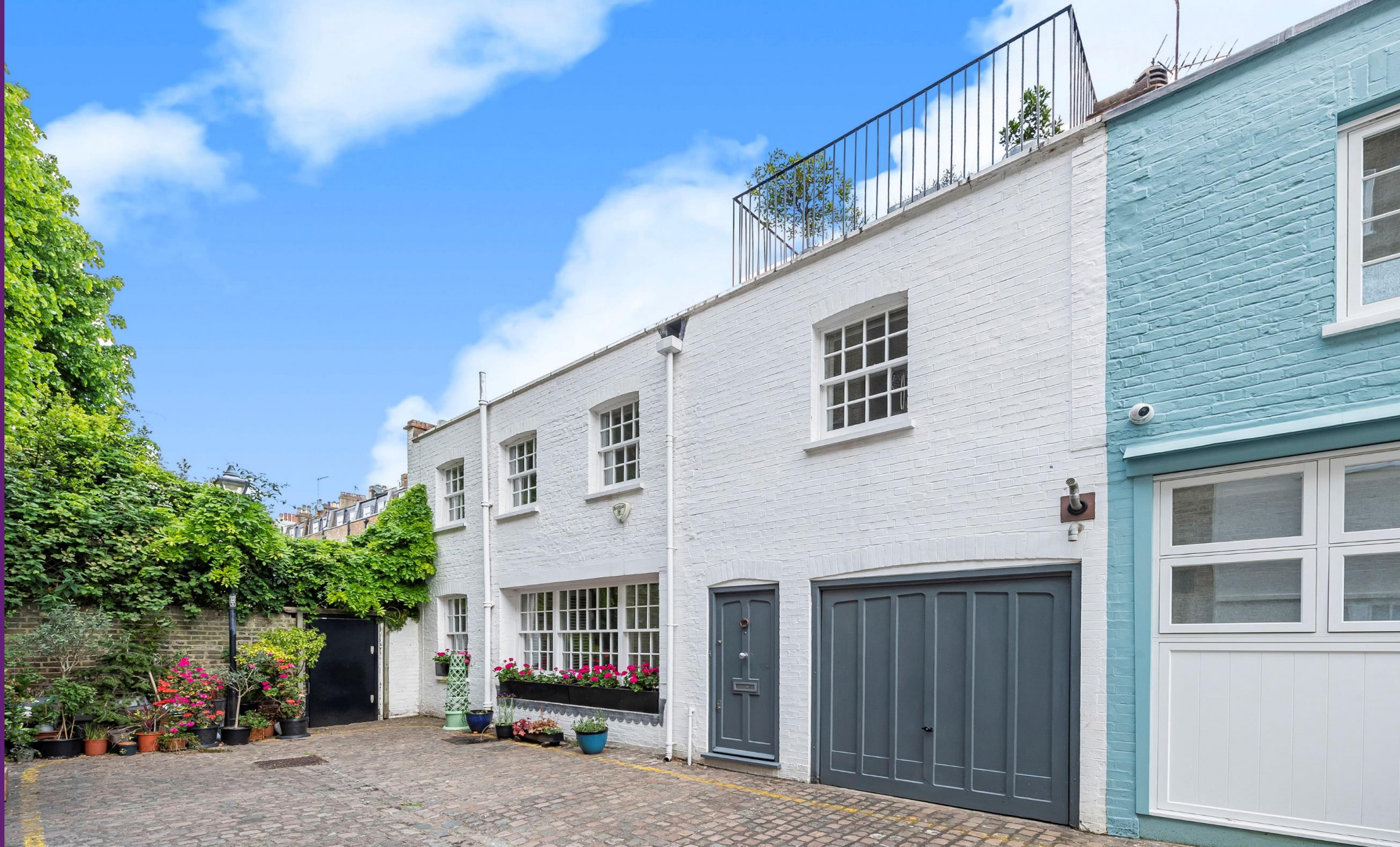
Victoria Grove Mews Notting Hill, W2